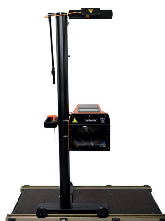
DR: DOUBLE RAIL