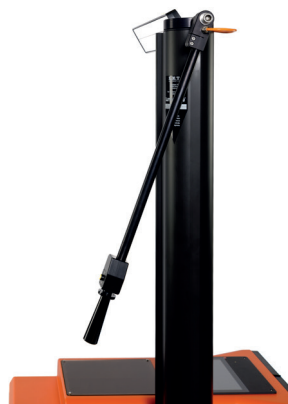
b. Ergonomic lever for easy adjustment of the alignment mirror or line laser module