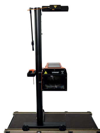
DR: DOUBLE RAIL