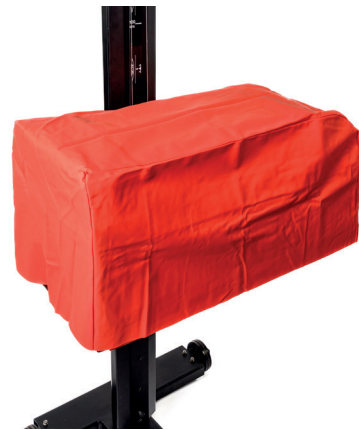
d. Additional protective dust cover (Included in standard delivery with new devices)

e. 15" touch screen mounted on the column (additional HDMI connectivity required)