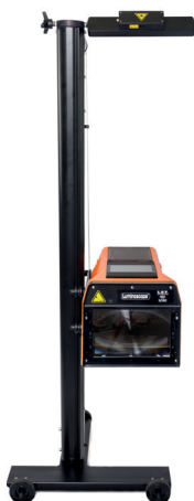
NR: NO RAIL