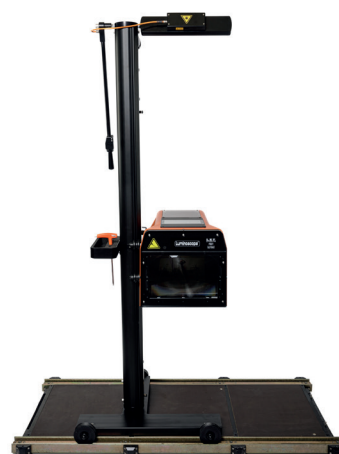
DR: DOUBLE RAIL