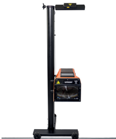
SR: SINGLE RAIL