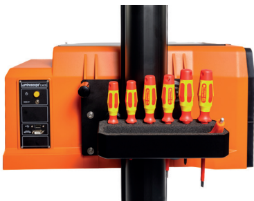
c. Tool holder for easy storing of most used tools