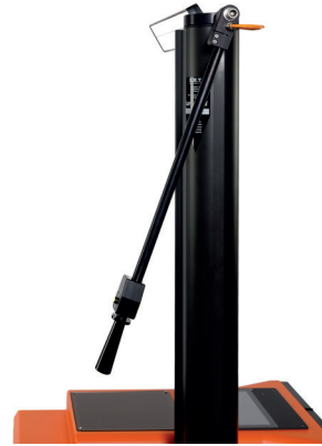
b. Ergonomic lever for easy adjustment of the alignment mirror or line laser module